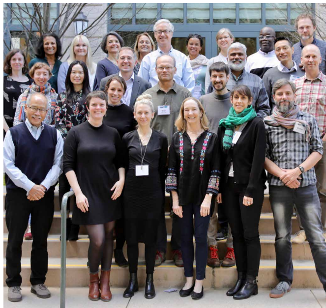
Team members of the Blue Food Assessment at the kick-off meeting at Stanford University in February 2020.

The assessment consists of a set of 8–10 scientific articles destined for Nature-Springer outlets. Blue food comprises extraordinary diversity and the papers examine the nutritional value of different species and their environmental impact.