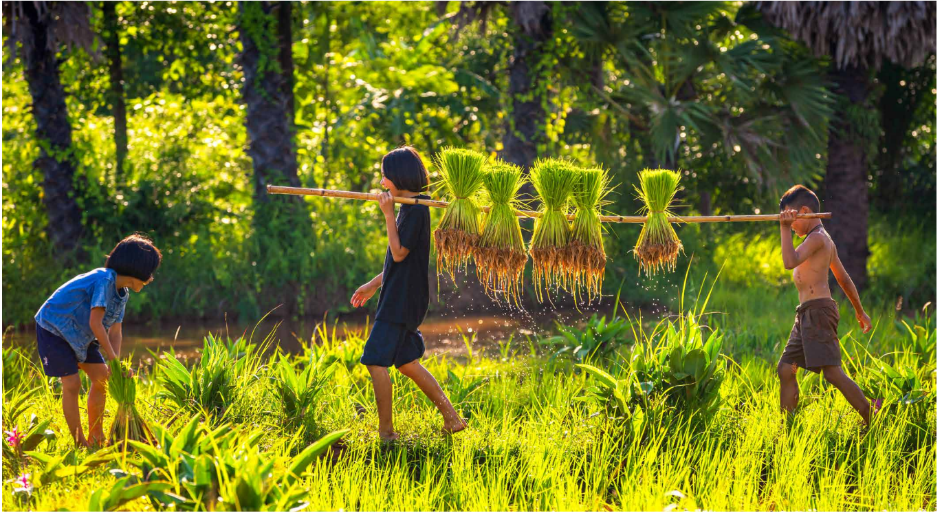
Children harvesting rice in Thailand.